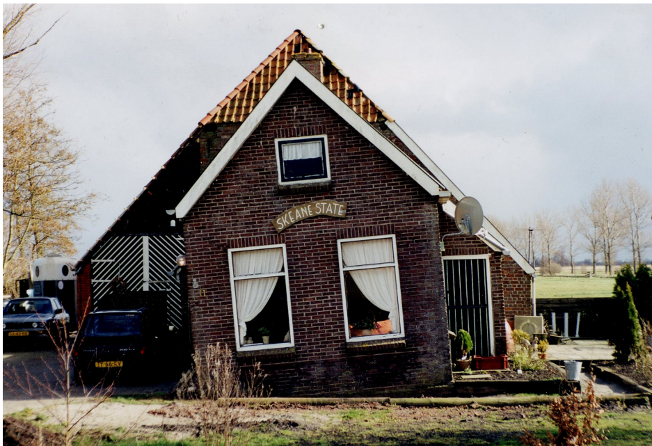
Fig. 3 Small-scale civil engineering problems.

The size of a civil engineering groundwater model can be chosen smaller than a regional model, because the area of interest is smaller (Fig. 3) and because short-term activities with a limited radius of influence allow close by model boundaries. This does not generally imply that the size of civil engineering models is small. The distance between the activity and the model boundaries highly depends on the overall hydraulic properties. Up to what distance can changes in groundwater level and potentiometric head be expected? Is the aquifer confined or phreatic? What is the order of magnitude of the transmissivities and vertical hydraulic resistances? To avoid inaccuracies and miscalculations, the model boundaries are better chosen at a safe distance.